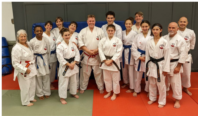
FRIDAY NIGHT ADVANCED CLASS