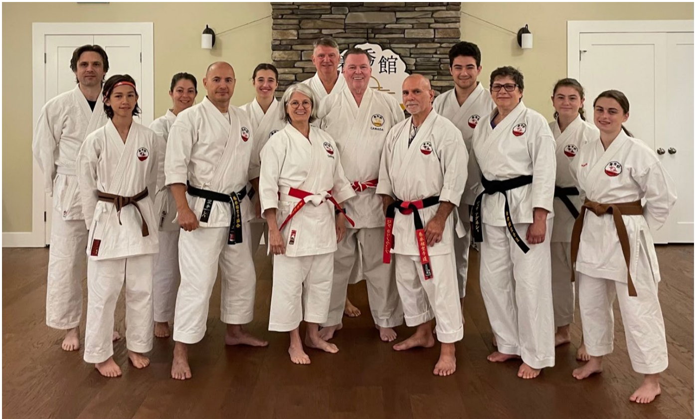
2022 YOSHUKAN CAMP PARTICIPANTS!