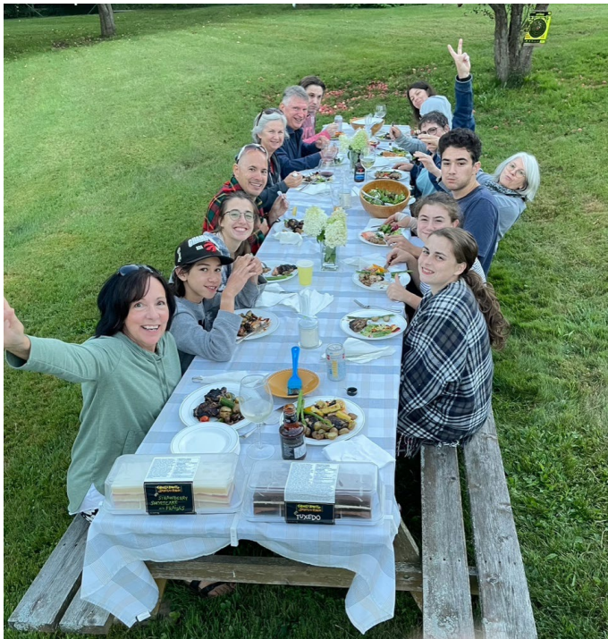
DINING OUTDOOR AT THE FARM! IN THE FOREGROUND!