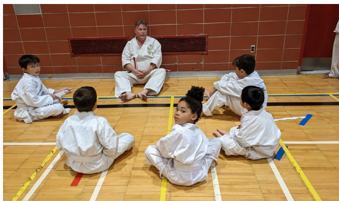
KANCHO 'SIT AND CHAT' WITH YOSHUKAN JUNIOR WHITE BELTS