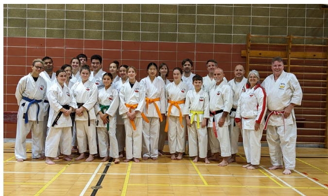
SATURDAY COLOURED AND BLACK BELT CLASS