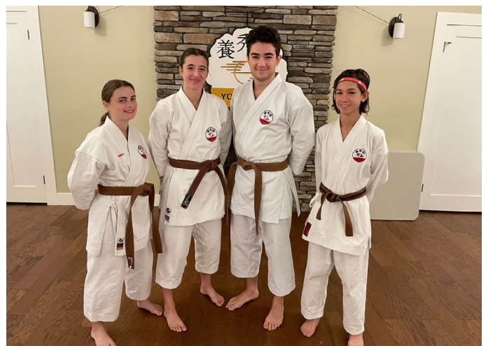
NEW YOSHUKAN BLACK BELTS!