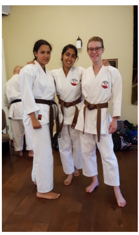
Karate Excellence Attendees!