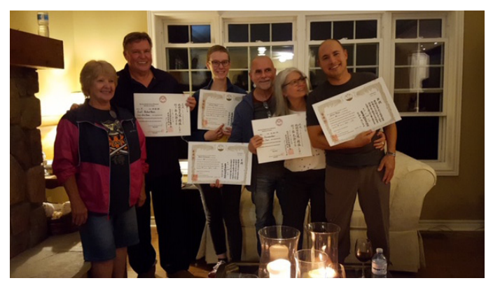
Yoshukan and Kobudo Students with new diplomas