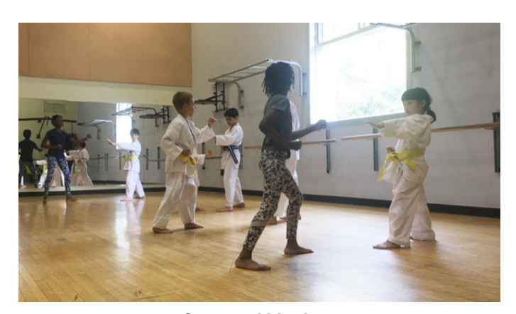
Summer kids class