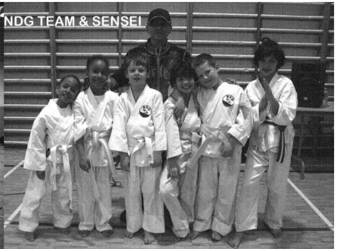
NDG TEAM & SENSEI