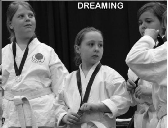
Yoshukan students and their instructors from Gadbois, YMCA St.Laurent and YMCA NDG, in competition at the biggest provincial event for young karateka, under the age of 15: "La Coupe Jeunesse".