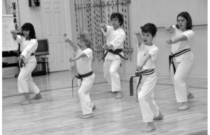
▲ Academy juniors performing Gega Sai