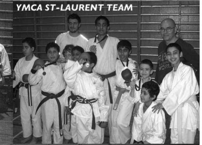
YMCA ST-LAURENT TEAM