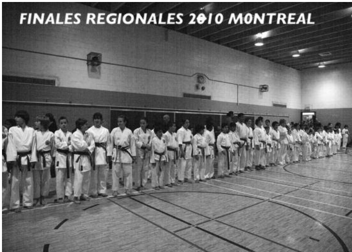
FINALES REGIONALES 2010 MONTREAL