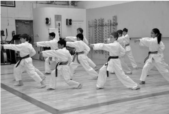
▲ Advanced juniors performing Seisan